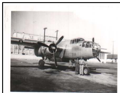
B-25 Fae took a ride on in October 1945.

Folks, Angela and I just watched the movie "Pearl Harbor." In the spirit of that please note the following: