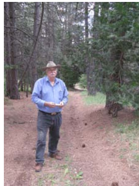
A recent photo of me up Humbug, CA.