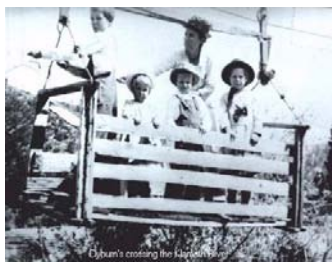
Clyburn's Crossing the Klamath at Lime Gulch

To me, it didn't seem like there was much on the sides, just wires ever 2 feet or so that hung from the cables to support the walk-way. Plenty of room to fall thru an into the river.